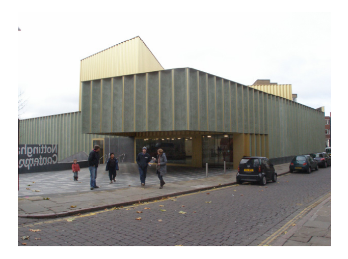
Figure 2: Nottingham Contemporary, 2009.

Today there are once again calls for putting architecture on a diet and there is no doubt that there will be such calls each time the capitalist machine breaks down. Critics have given different names to this latest recession-fueled diet: the New Modesty, the New Puritanism, Radical Traditionalism, slow architecture etc. The last name dubbed by Swiss architect Peter Zumthor is a wordplay on the phrase 'slow food' conspicuously referring to a healthy diet. Zumthor explained it as "tradition, but with a modern twist," more like "Paul Smith, not Jean Paul Gaultier."<sup>32</sup> Zumthor's remark resonates not only with Kiesler's statement, but also with Loos' praise of the discrete